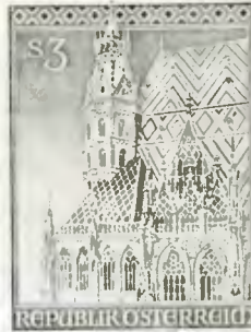
Romanesque West Front, Heathen's Tower, and Friedrich's Gable.