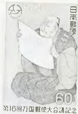
"The Program Announcer"

Sharaku Toshusai Worked 1794-5 only Ukiyo-e woodblocks Colors on mica background H 36.8 W 24.4cm Le Doux Collection Metropolitan Museum New York Late Edo Period.