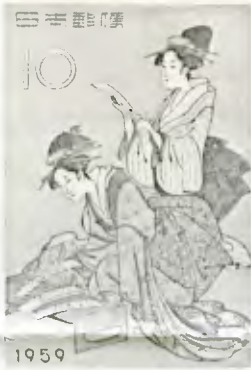
Two Women Reading Poetry (c. 1781-95) By Hosoda Eichi (1756 - 1829) From one of the Eight Scenes of Ukiyo-e Genji. Woodblock Print. Color on paper. Late Edo Period.