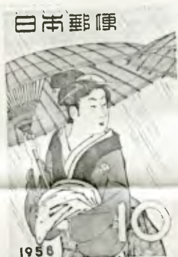
"A Beautiful Woman With An Umbrella" (c. 1783)

By Kiyonaga Torii (1752-1815) Detail from a print "Beautiful Women Coming Back From the Bath in Wet Weather" Ukiyo-e woodblock. Color on paper.