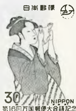
"Woman Reading a Letter" (c.1794)

These are from a series: "Ten Studies in Female Physiognomy" Colors and white on mica background. H. 38.7 W. 25.7cm.