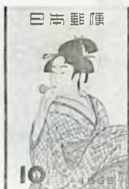
"Girl With Glass Pipe" (c.1793)