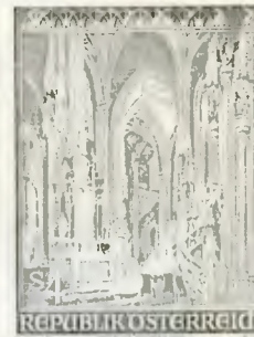
Interior. Albertinian Choir from the North side aisle of the Nave.