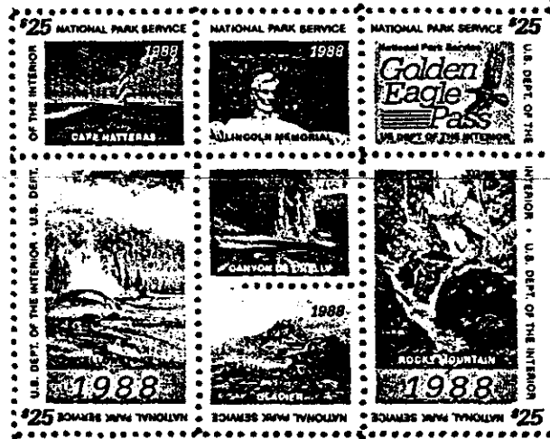
The works of art shown on this new stamp were selected from the winners of a national art contest.

In the first article, the new National Park stamps were introduced with much fanfare. These are revenue stamps created by the US Department of the Interior which will be used to validate the Golden Eagle Pass. The article shows that the "stamp" is actually a setenant block of seven smaller stamps, which must all be purchased together for $25.