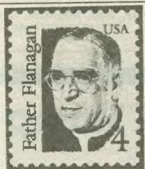
Edward Joseph Flanagan Scott 2171

A 1986 4¢ Great Americans stamp features the gentle and generous Father Flanagan. ■