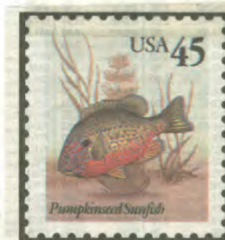
The design of the U.S. 45c Pumpkinseed Sunfish stamp scheduled for a Dec. 2 release at the National Aquarium in Washington, D.C.