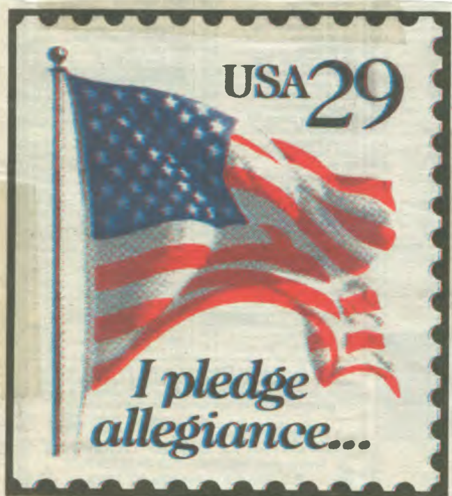
The design of the 29c Pledge of Allegiance booklet flag stamp the United States Postal Service will issue Sept. 8.