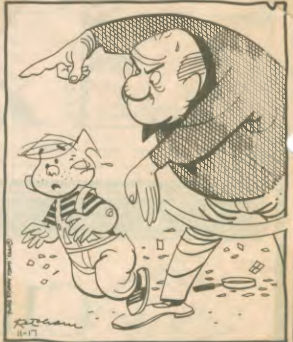
Dennis the Menace/by Hank Ketcham

"BOY! YOU'D THINK I SNEEZED ON YOU INSTEAD OF YOUR DUMB OLD STAMP COLLECTION!"