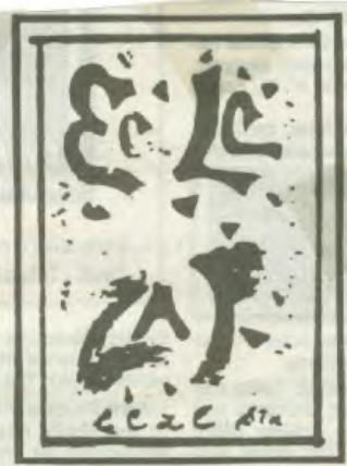
This was an approved Aug. 11 cancel in Columbus, Ohio.