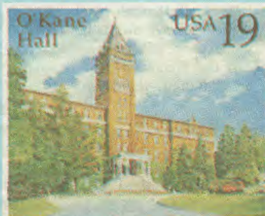
Holy Cross College Bicentennial