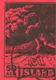
SMALL COUNTRY (VOLCANOS)