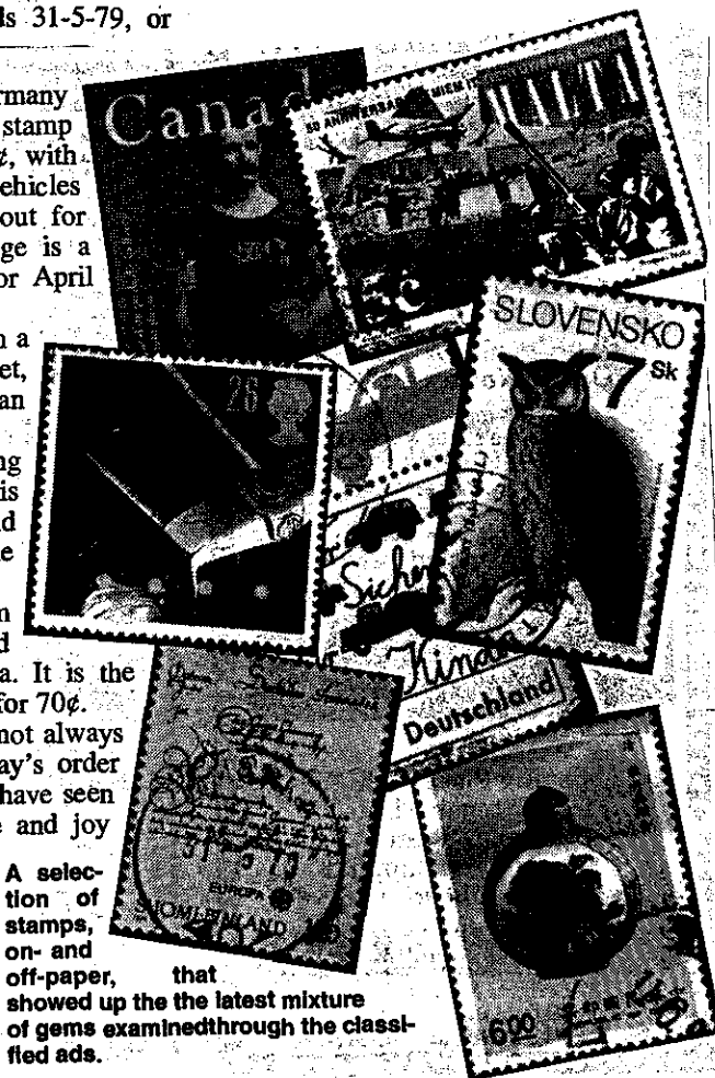
A selection of stamps, on- and off-paper, that showed up the the latest mixture of gems examined through the classified ads.

There are several that offer this type of mixtures. Some as low as a dollar or two or up to the seventies in price. Give it a try, you might that missing stamp for your collection.