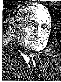
U.S. Postage 8 cents