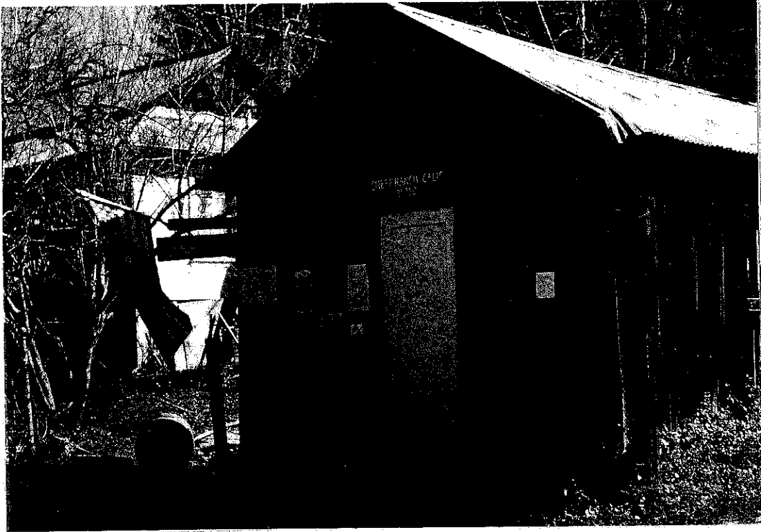
Sheepranch, Calif. Post Office