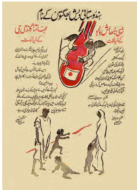
BNS 29 – TO INDIAN PATRIOTS

To the left is a propaganda leaflet from the British to the Indian troops and below is one from the Germans. Such propaganda littered the Indian soil during WWII. The British, of course, opposed the Indian revolutionaries while the Germans supported them. Germany wanted to tie the English army up in a fight in India so they could concentrate more on the eastern front.