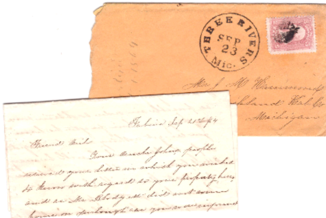
Written during the Civil War (9-21-1864). Lincoln was still in office

penmanship. The cover and letter below is an example of that writing.