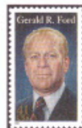
15. Gerald Ford