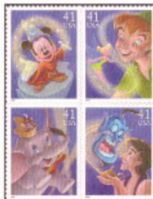
12. The Art of Disney: Magic