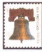
21. Liberty Bell Forever