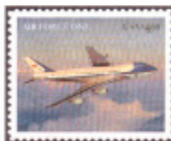
28. Air Force One