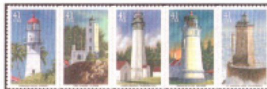
7. Pacific Lighthouses