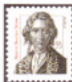
27. Harriet Beecher Stowe