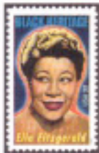
1. Ella Fitzgerald