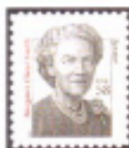
26. Margaret Chase Smith