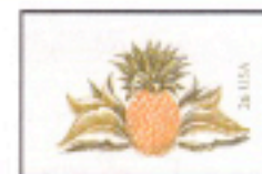
40. Pineapple postal card