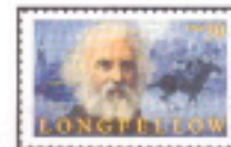
4. Henry Wadsworth Longfellow