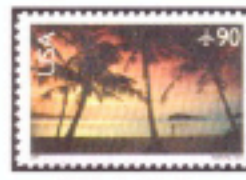
25. Hagahna Bay Guam