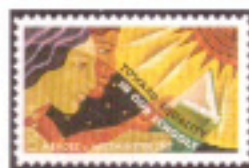
17. Mendez v. Westminster