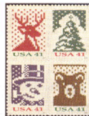
36. Christmas Knits