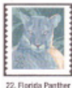
22. Florida Panther