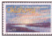
2. Oklahoma Statehood