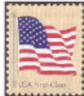
33. American Flag