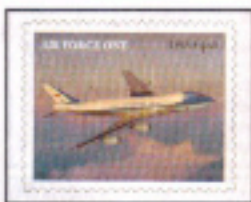
37. Air Force One stamped envelope