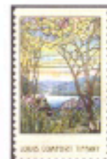
11. Louis Comfort Tiffany