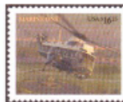
29. Marine One