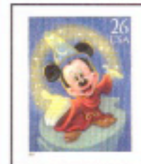
44. Art of Disney: Magic picture postal cards