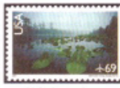
24. Okefenokee Swamp