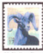
23. Big Horn Sheep