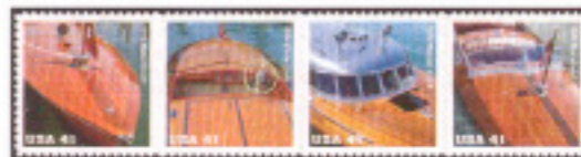
10. Vintage Mahogany Speedboats