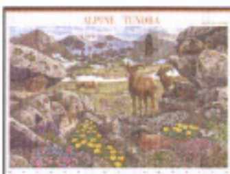
14. Alpine Tundra