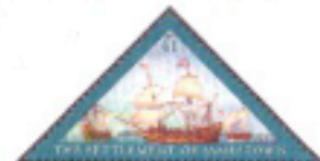
5. Settlement of Jamestown