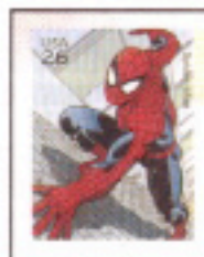
43. Marvel Comics picture postal cards