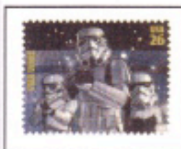
41. Star Wars picture postal cards