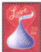
20. Hershey's Kisses