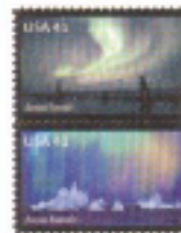
18. Polar Lights