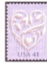
30. Silver Hearts