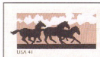
39. Horses stamped envelope