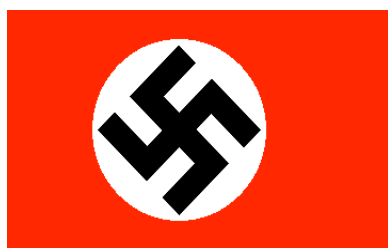
Nazi Germany - WWII

As many of you know, I collect Nazi Germany and Vietnam (mostly North), in other words, the enemy. I found a website that is right up my alley. Besides, it has a neat name. This is a philatelic site that encompasses stamps, propaganda postcards, covers and labels (AKA cinderellas). Eighteen countries are represented here by the flags they used while they were our enemy, some of the flags are still in use and