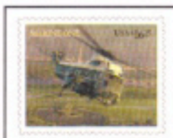
38. Marine One stamped envelope