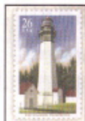
42. Pacific Lighthouses picture postal cards