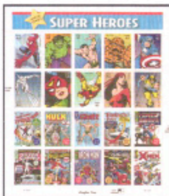
9. Marvel Comics