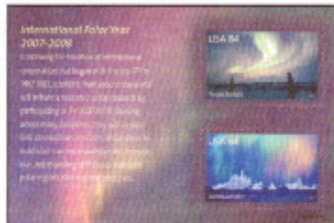
3. International Polar Year