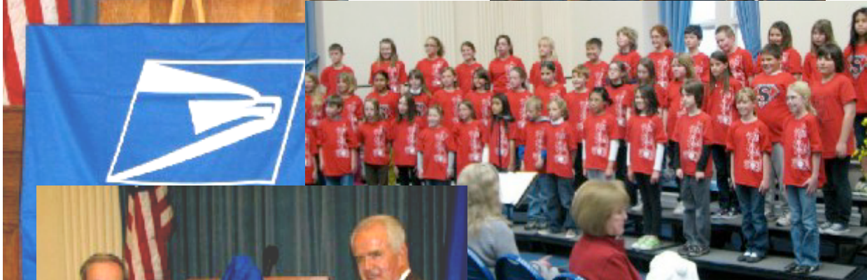
The Seegler School Children's Choir sang the state song and the governor presented our stamp.