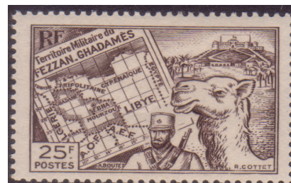
Fezzan-Ghadames regular issue

The above article comes from the Sandyfaire website. The Fezzan occupation, being very short, produced only thirty-five stamps consisting of regular issues, semipostals, airpost, officials and postage due. They are relatively inexpensive at $109.00 for mint and the same for used, according to my old 2007 catalog. Great looking stamps, well worth the price. But the collection doesn't end with the stamps of Fezzan. There are also the stamps of Ghadames and the stamps of Fezzan-Ghadames. All are occupation stamps. Now, Ghadafi owns it all!