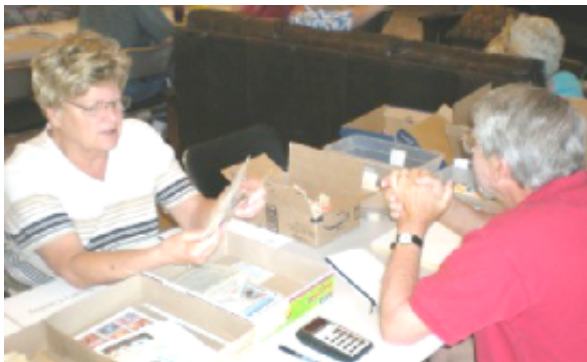
Buyers and sellers