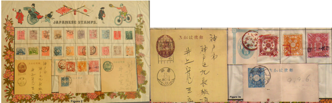
The full sheet is on the left and a close-up of the left lower corner is on the right.

are reproduced from earlier sheets. These last two sheets were probably produced in the 1950s - maybe as early as the late 1940s. These last two sheets are not listed in the reference material since the author stopped his listing in the late 1930s.