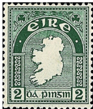
Figure 1. The first definitive of the new Irish Free State depicts a map of the entire island, including the British northern part.