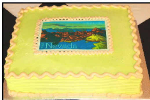
The Awards Banquet cake with the image of the 2014 Nevada Statehood stamp

The stamp show was just a part of "Reno is Artown" and also part of the official Nevada Sesquicentennial Celebration. Special commemorative tokens were struck at the Carson City Mint and made up part of the awards given out for the show.