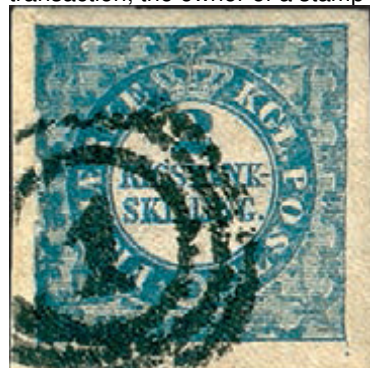
Figure 2. Denmark Scott 1a is a higher value stamp that should be examined by an expert. This stamp was repaired, with the left margin paper added, some left edges of the design painted in, and the postmark in the left margin also painted in.

In John Wayne's context, this is a constant battle, even though many