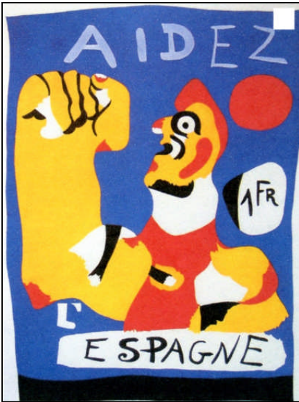
The proposed stamp design

It was first painted in gouache, then executed as a stencil, but was never produced as a stamp. The stencil served instead as the basis for a limited-edition poster. This was sold at the Spanish Pavilion at the Paris Exposition.