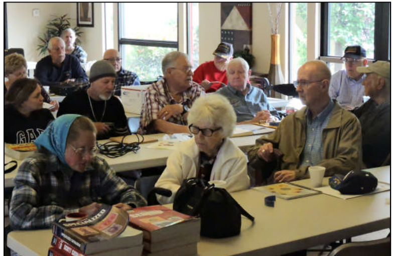
Some of the members at the May 26 meeting.