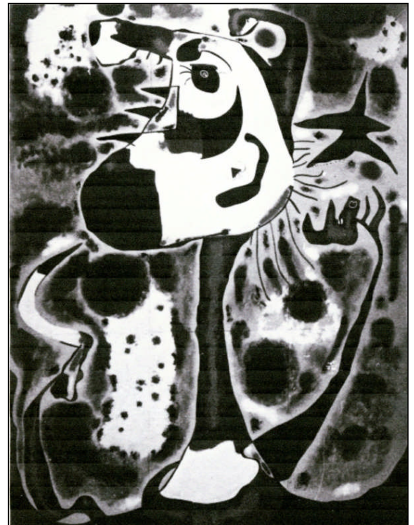
B/W Image of the mural

On the mural, the left arm is a thin flare, while the right wields a vicious sickle.