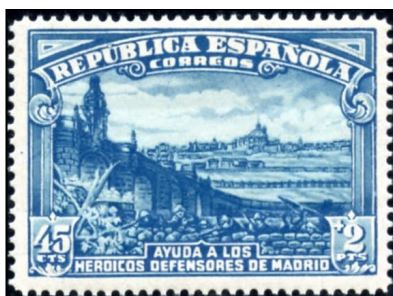
Surtax stamp for the defenders of Madrid, issued April 15, 1938. Scott B106. On the left is the stamp surcharged.