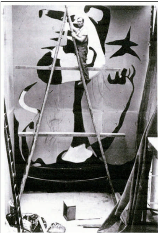
Image of Miro on a ladder working on the mural ( http://www.tate.org.uk )

There are only B/W photos of the mural which was two stories tall and painted opposite the stairway between the second and third floors of the Pavilion.