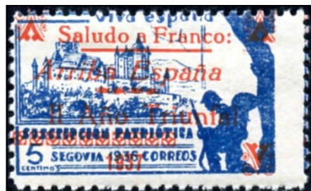
Local overprinted issue – not listed in Scott.

Block of 4 imperforate is probably a Cinderella S/S. It is overprinted VIVA FRANCO. Ayamonte is a small town at the extreme southwestern corner of Spain, on the Atlantic coast.