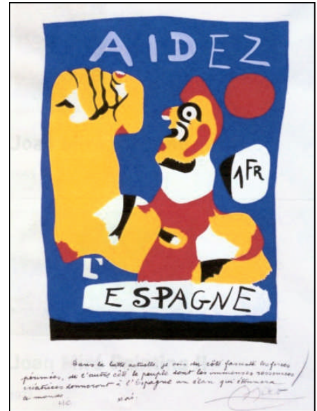
Limited edition poster

Miro's "Catalan Peasant in Revolt" on the proposed stamp and poster depicts a red-checked Catalan workman wearing a traditional red Catalan barretina cap with his massively enlarged right arm (as thick as his body) raised in Republican (Spanish Government) salute with his clenched fist larger than his head. His face is drawn in profile, and his right