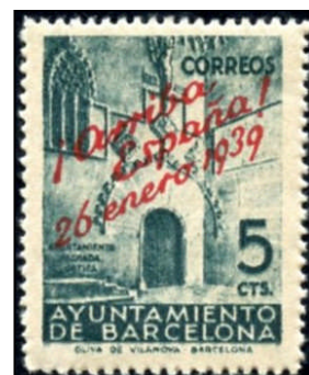
Local overprinted stamp, not in Scott.