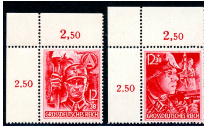
B 292 and B 293

For reference, the Scott Catalogs show these as Germany B 292 and B 293 often described as Nazi Party Formations.