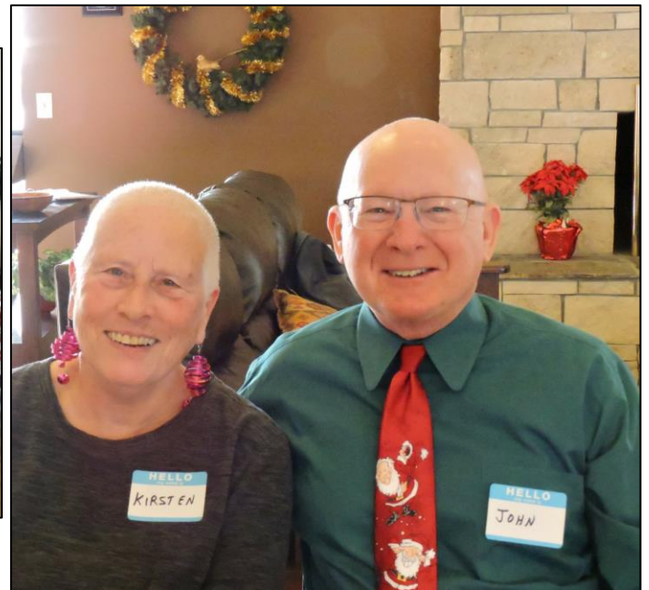
Since the editor rarely has his picture taken at meetings, I thought I would include it with my wife.

All the party photos are here: http://renostamp.org/holiday_party2019.html