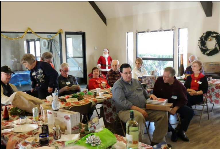
The other table with members and spouses.