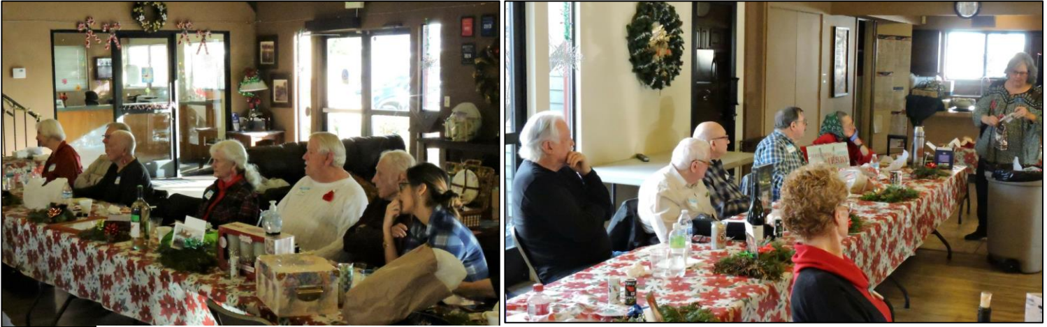
Two of the tables with members and their spouses/family.