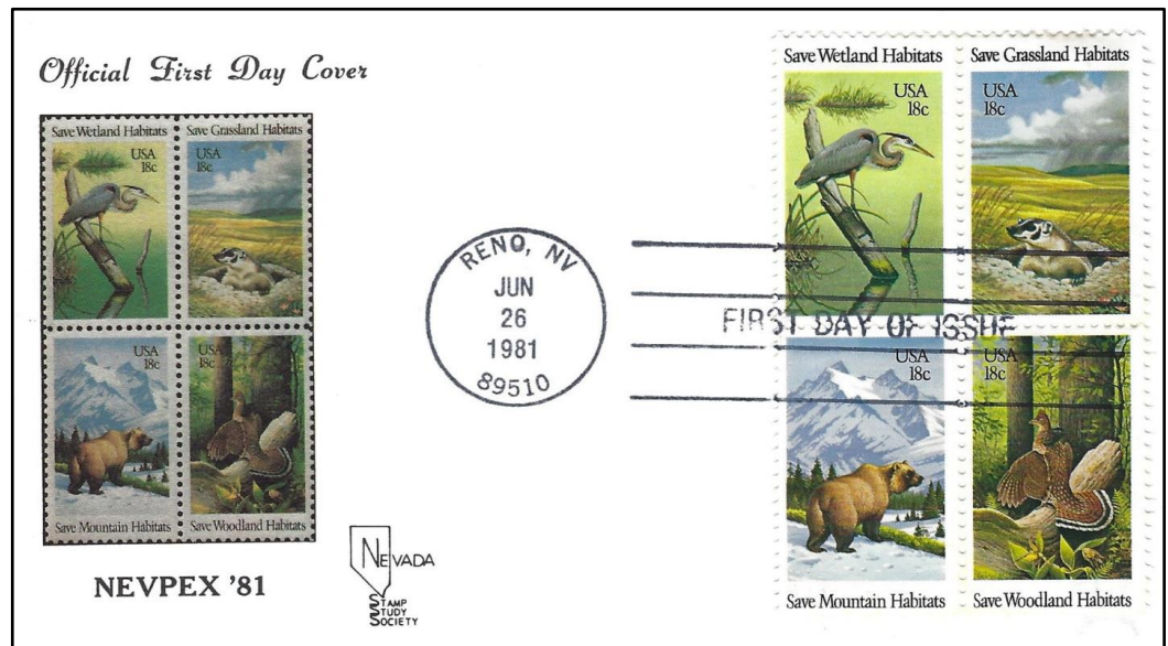
First of many Reno First Day of Issue stamps on NEVPEX show cover.

Our first national show was to host the annual convention of the American First Day Cover Society (AFDCS) in 1981. As a Life Member of the AFDCS, I went to one of their conventions back east and asked the Society president why they never had a convention out west. She replied, "We do! We've held conventions in Chicago." I explained to her that that was a whole lot of country west of Chicago. She asked if I would be willing to be the Show Chairman if they agreed to come to Reno. I said "definitely yes!" Since the USPS routinely schedules a First Day Issue at the AFDCS convention, I immediately sent a request to the Citizen's Stamp Advisory committee recommending they issue a stamp for the protection of Lake Tahoe. I got a reply back that they preferred to do a stamp subject that would have national appeal as opposed to just local interest. As a result, on June 26, 1981, a block of 4 "Save the Habitats" stamps became the very first First-Day Issue in Reno. I also contacted a professional cachet producer and requested they produce a colored cachet for us to use. They replied it would be too costly to us to get a special cachet, but they agreed to add our logo to the design they had already approved (at no cost). Needless to say, we bought a number of their covers to sell at the club table.