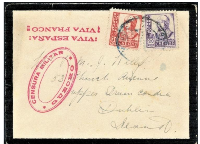
Above is an image of a Spanish military censored cover dating from the time of the Spanish Civil War in the late 1930's. It obviously is from a pro-Franco supporter.