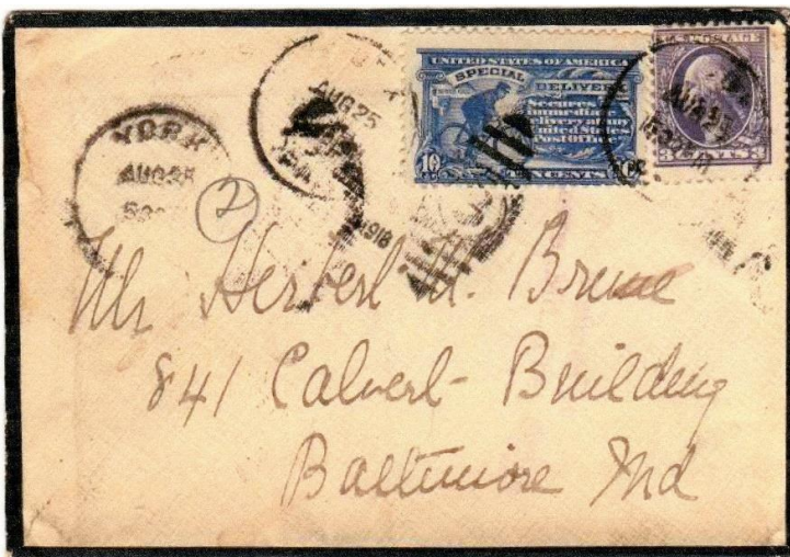
Above is an image of a U.S. mourning cover from the end of the World War I time frame.

Popularity of mourning covers declined abruptly in the 1930's, although they remain somewhat in vogue in parts of Europe.