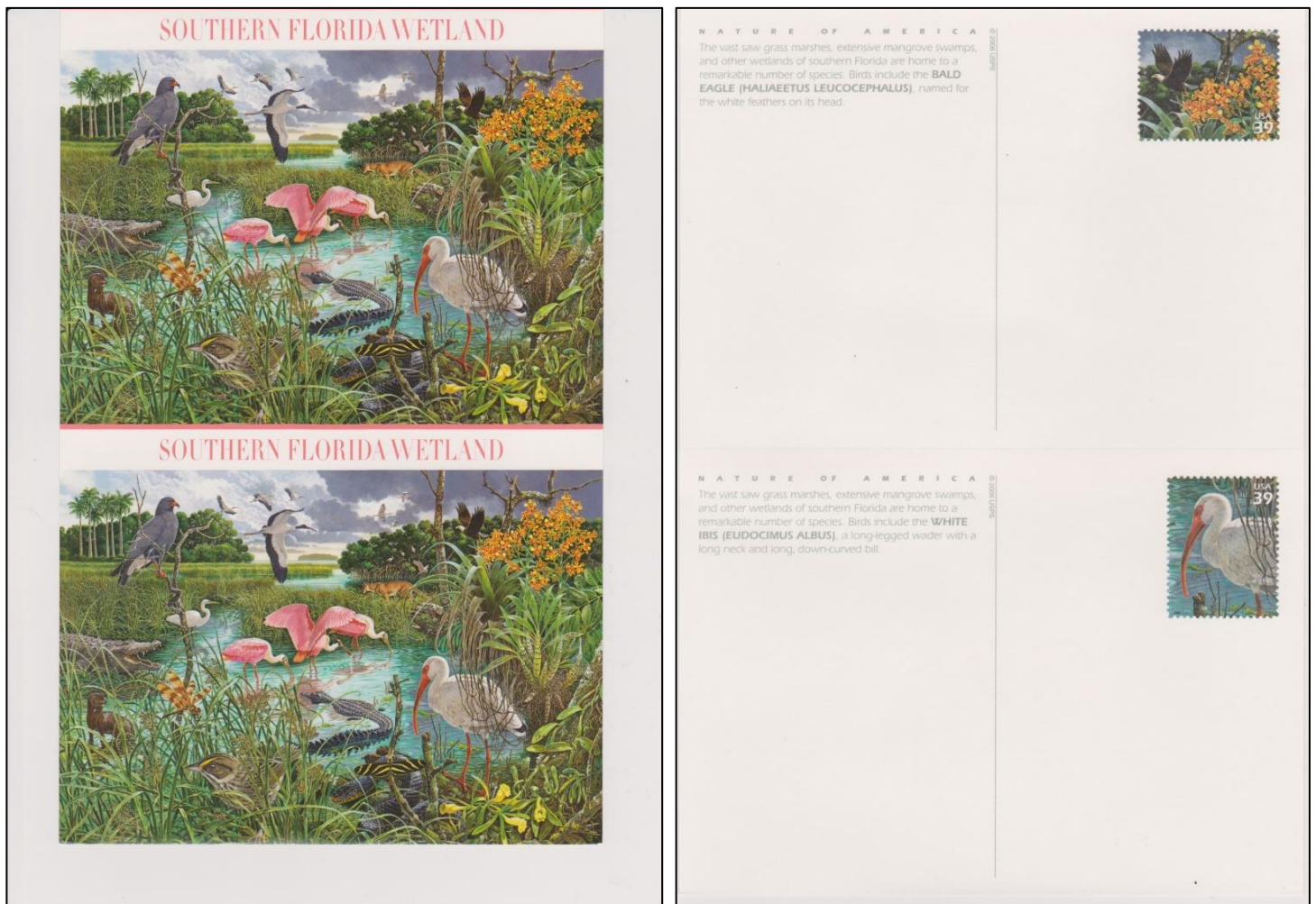
The view side of the postal cards and the address side of the cards.

The normal size of a postal card was not large enough to effectively show the overall design, so they made each card 5" x 7". This was larger than was allowed to receive the reduced card postage rate of 24¢, and instead the letter rate of 39¢ was required. The USPS probably assumed the increased size and cost would limit the cards' usefulness.