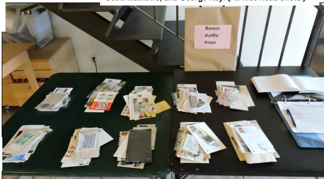
Raffle table with 10 prizes and the bonus prize. 9-23-23 meeting.