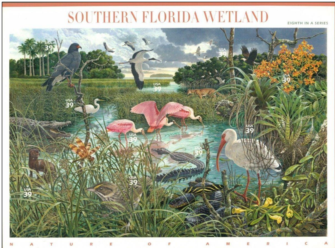
Full pane of 10 39¢ stamps. This was pane number 8 in the 12-pane series of Nature of America.

But when I called the Stamp Fulfillment Center in Kansas City to place an order and asked for two sets of the just issued Southern Florida Wetland cards (a package of 10 cards) I was told they were sold out. Wait a minute – these cards had been issued only 2-3 weeks previously! “Sorry, but these were a special issue and went quickly.” Aargh! I never heard of a “Special Issue” card. Another USPS rip-off! The Post Office lost a long-time collector customer that day. My only regret is that I didn't quit collecting the new issues years earlier.