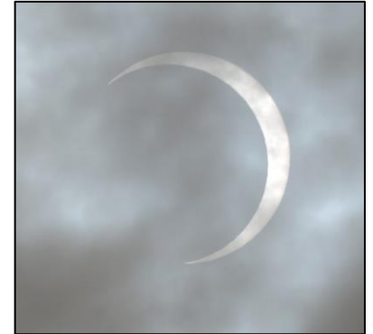
Annular solar eclipse as viewed at stamp club meeting venue.

A special treat at the meeting was an annular solar eclipse seen with 85% of the moon obscuring the sun. Special viewing glasses were available and since it was a partly cloudy day, the clouds provided a viewing by the naked eye. See photo on right.