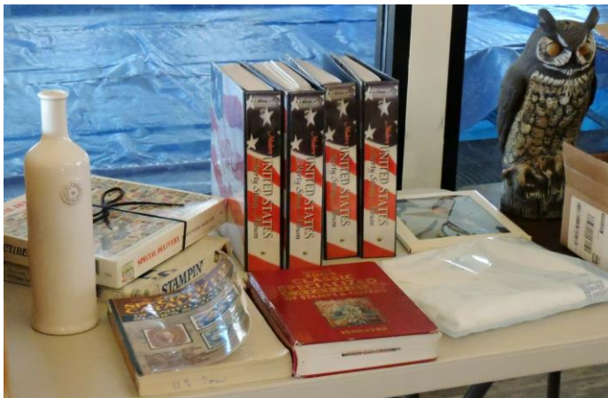
Some philatelic and non-philatelic items from 2021 Auction Bucks auction.