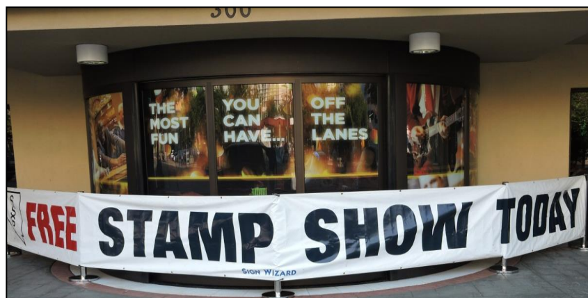
Entrance to the Bowling Stadium with our stamp show sign

On July 27 and 28 the Nevada Stamp Study Society is hosting the 2019 Greater Reno Stamp & Cover Show. Once again, it will be held in the Hall of Fame Museum on the first floor of the National Bowling Stadium. It is located at 300 North Center Street with free parking in the stadium garage. Show hours are 10 a.m. to 6 p.m. on Saturday and 10 a.m. to 4 p.m. on Sunday. Our theme this year is celebrating the 50 th anniversary of the landing of the first man on the moon. Show covers will be available with a special show cancel