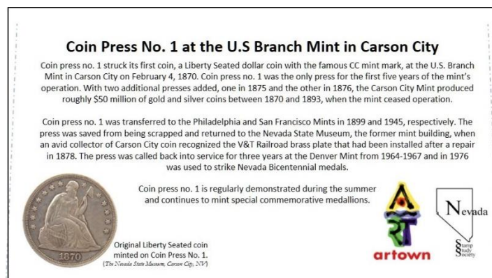
Mock-up of the cover with special cancel and info on Coin Press No. 1.

The July 26 th show cover (above) celebrates "150 Years of Minting in Nevada." It also includes its own special pictorial cancellation with one of the "Enjoy the Great Outdoors" stamps issued June 13, 2020, at Incline Village, NV, along with a brief history of Coin Press No. 1 and the Carson City Branch Mint. The minting cancellation is based on the design of special commemorative medallions issued by the Nevada State Museum.