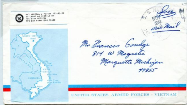
Sent on Nov. 28 (unknown year) to Marquette Michigan 49855