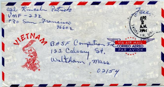
Sent on April 2, 1961 to a commercial address in Waltham, Mass 02154

Both letters were sent from Cua Viet, South Vietnam. Both have the same circular postmark: U.S. Navy 14009 Br. Unit