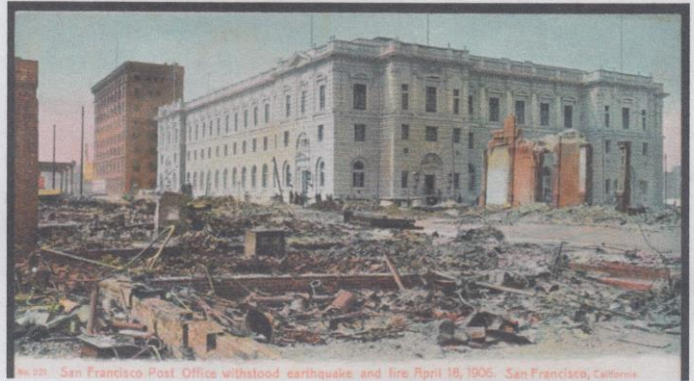
Post card view of the San Francisco's main post office, saved by about a dozen loyal and courageous employees who extinguished fires.

As an emergency measure, mail without stamps was accepted until the sale of stamps was possible at the main post office on April 25. Mail was postmarked in San Francisco and sent to the receiving post office, where postage due was assessed, postage due stamps affixed, and the fee collected from the recipient of the letter.