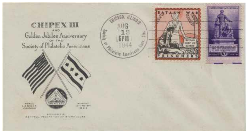
Cover with Bataan War Prisoner Cinderella to raise funds to support the Bataan POWs