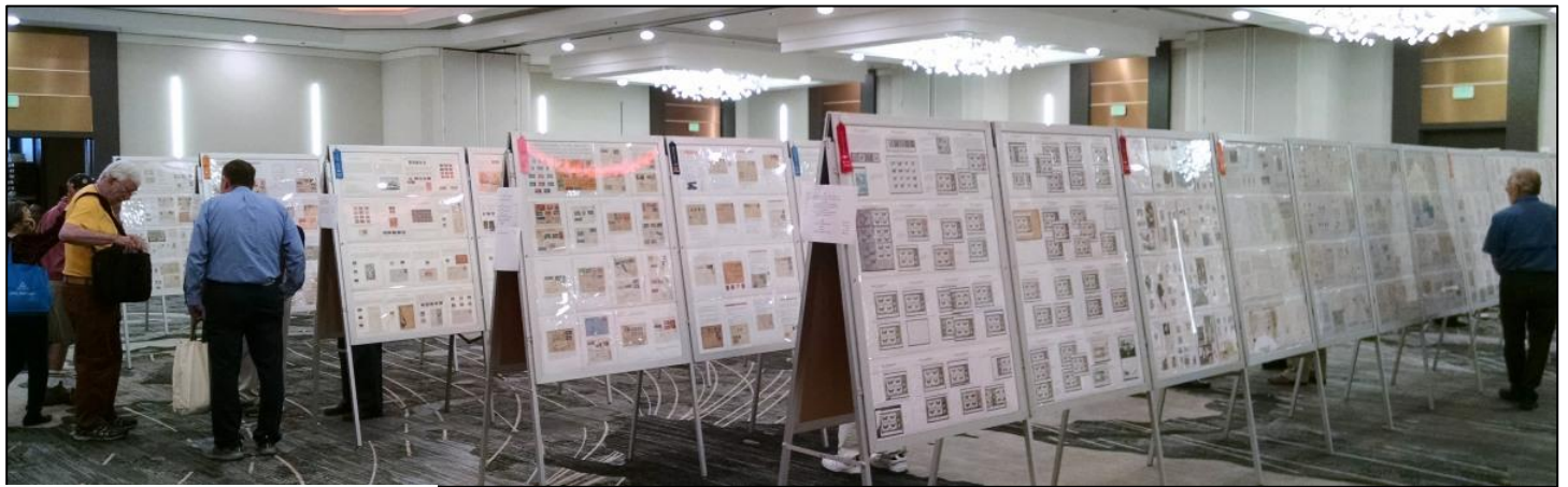
Exhibit area with 202 frames

Usually, the show admission is $5 for all 3 days, this year it was free (for first 1000 attendees registering). Nice! Also, the usual Marriott parking of $20/day was at a reduced rate of $5/day with a WESTPEX ticket.