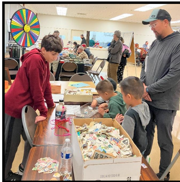
PENPEX Youth area.