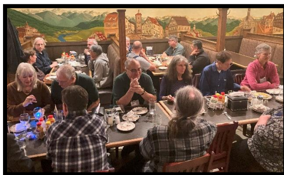
The awards dinner at Harry's Hofbrau.