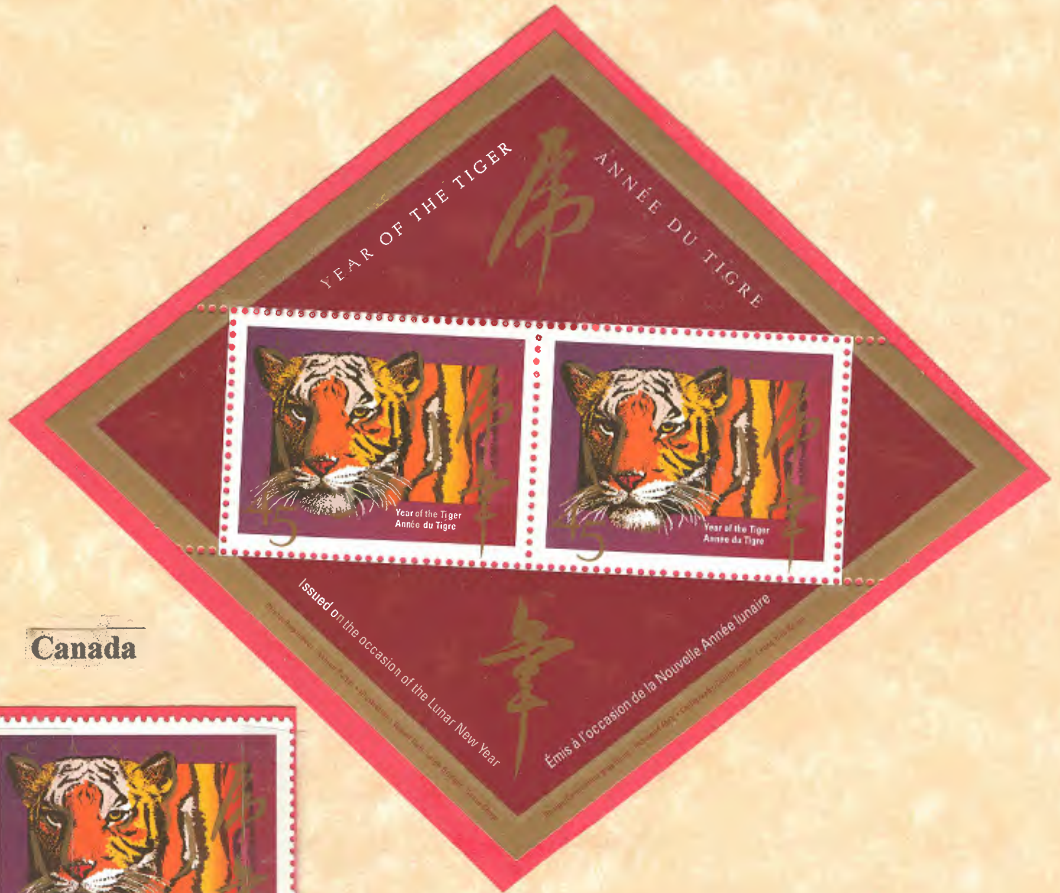
Se-tenant on souvenir sheet with single stamp.