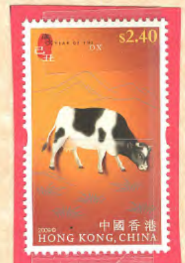
Hong Kong – Se-tenant made up of four adjacent stamps with syncopated edges on souvenir sheet. Lithography with foil application. Four single stamps and the highest denominated one on a second souvenir sheet.