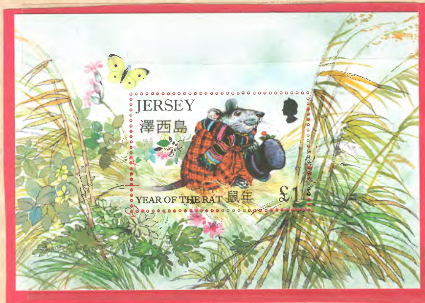
Jersey -- One of the Channel Islands located between Great Britain and France.