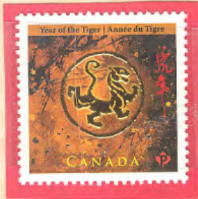
Embossed single stamp and stamp on bookmark.