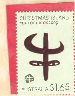
Christmas Island – Gutter strip with se-tenant zodiac animals in the gutter. Two single stamps, one with an ox and the other a Chinese character for the animal. Lithography with foil applicaton. A se-tenant of the ox and Chinese character on a souviner sheet.