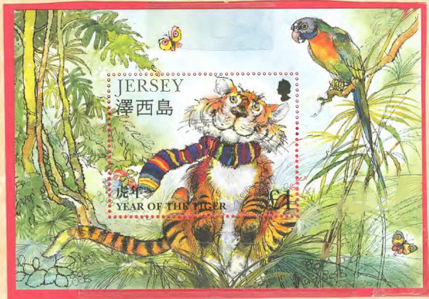
Jersey – Single stamp on souvenir sheet.