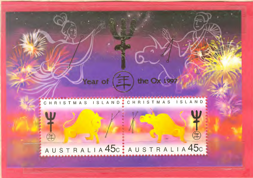
First day cover.

Christmas Island (A Territory of Australia). In the Indian Ocean 230 miles south of Java. Started celebrating New Year in 1994 with the year of the Dog. In 2002 a new artist designed the most recent stamps.