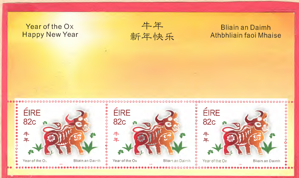
Ireland – Three joined stamps of the same design on a souvenir sheet.