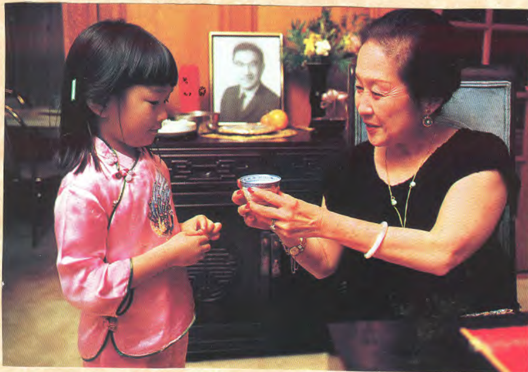
Ritual passing of the teacup from child to grandparent to show respect and ushers in the Chinese New Year.