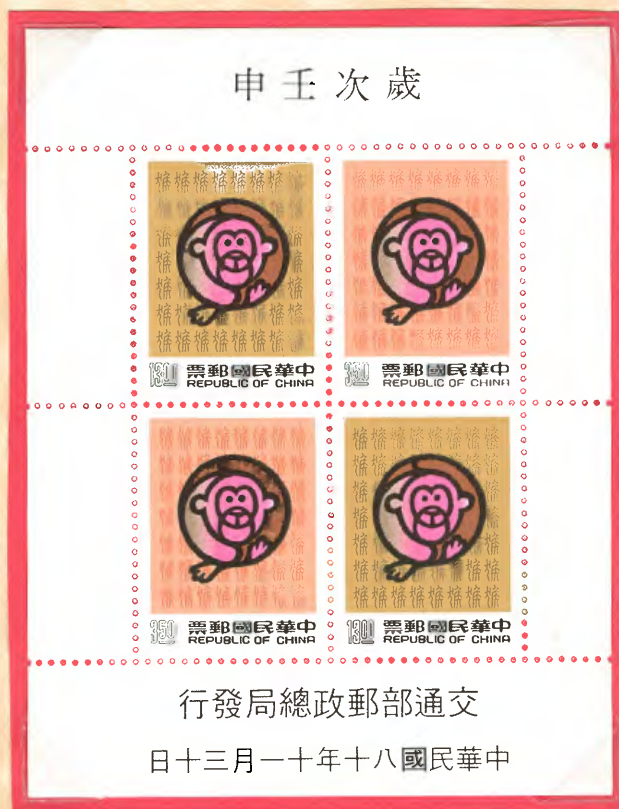
China – Two pairs on souvenir sheet