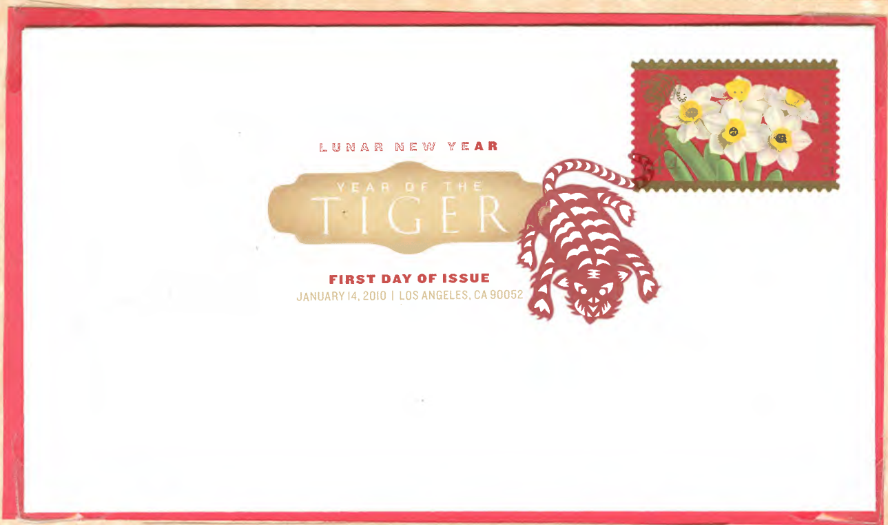
United States – Sheetlet and first day cover for the tiger.