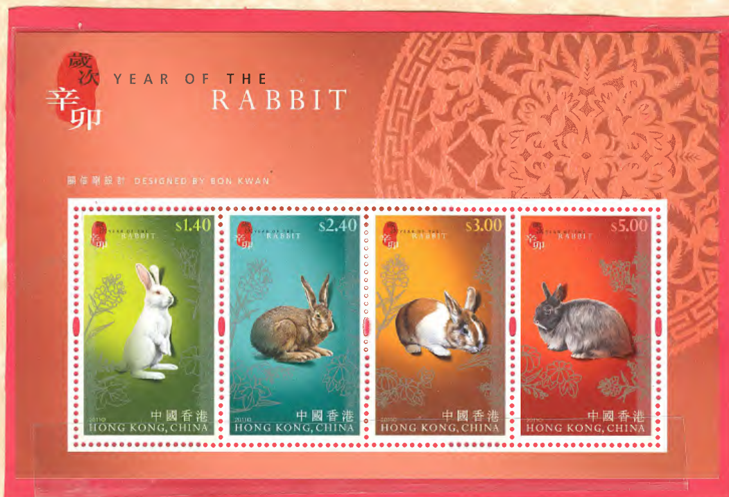
Hong Kong – Se-ttenant of four stamps on a souvenir sheet. The highest denominated stamp on a souvenir sheet.