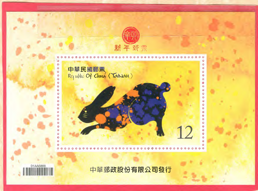
Taiwan – Single stamp on souvenir sheet.