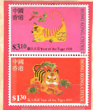
Hong Kong – Se-tenant stamps. The higher denominated stamp used on a air mail letter to the United States.

Flat G 31sf F1 Fullview Court 32 Fortress Hill Rd North Point HONG KONG