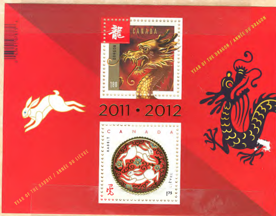
Canada – Souvenir sheet using the rabbit stamp from 2011 and the dragon stamp from 2012