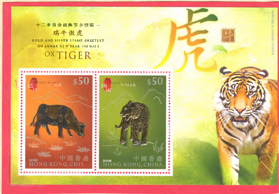
Hong Kong – Embossed gold used on se-tenant souvenir sheet.