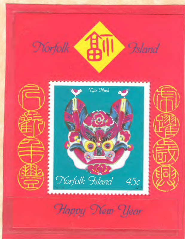
Norfolk Island – Single stamp on souvenir sheet.

Marshall Islands Chain of islands in western Pacific. 2,500 miles south of Japan. One of the Federated States of the United States.