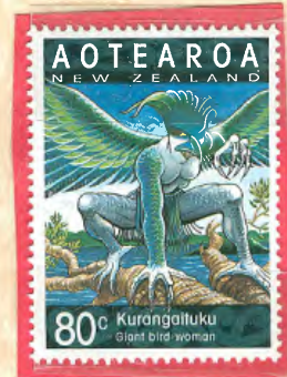
New Zealand – Five single stamps, two of which are repeated on souvenir sheet. Lithography.