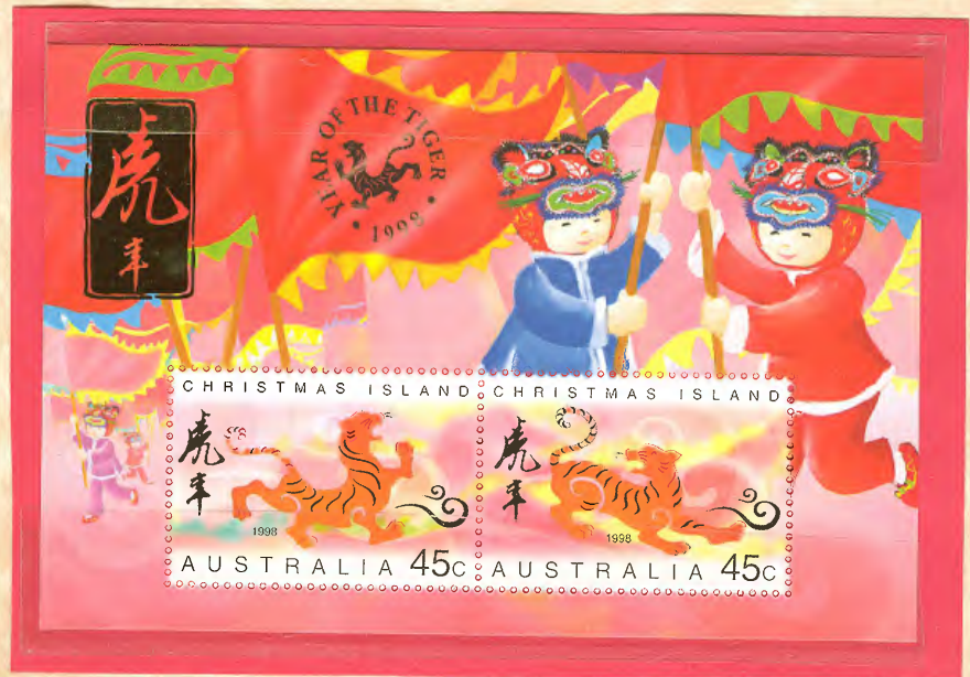
Christmas Island – Se-tenant on souvenir sheet.

Christmat Island – Se-tenant in gutter strip with animals in the strip. Lithography with foil application.