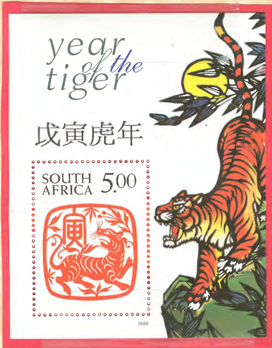
South Africa – Single stamp on souvenir sheet.